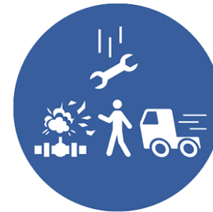
LINE OF FIRE