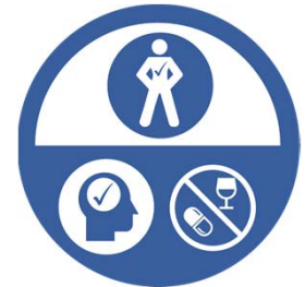
FIT FOR DUTY