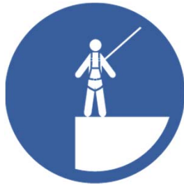
WORKING AT HEIGHT