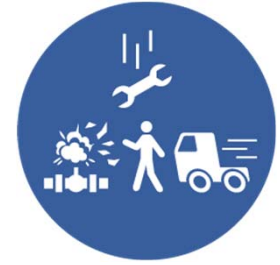
LINE OF FIRE