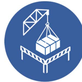
SAFE MECHANICAL LIFTING