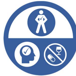
FIT FOR DUTY