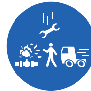
LINE OF FIRE