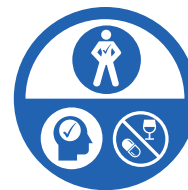
FIT FOR DUTY