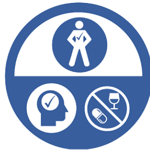
FIT FOR DUTY