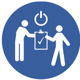
BYPASSING SAFETY CONTROLS