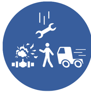
LINE OF FIRE