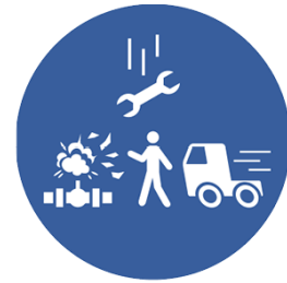
LINE OF FIRE