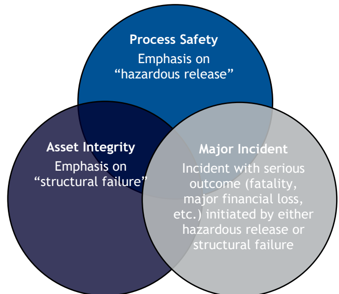
Figure 3: Related concepts