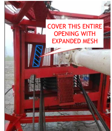
View of engineering guard to prevent improper spooling of drill line

Help industry by sharing lessons learned from an incident. Submit your Safety Alert.