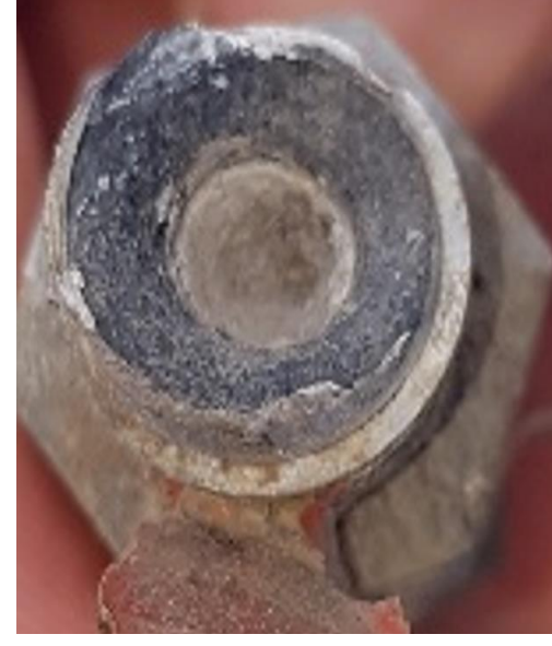
PRESSURE RELIEF VALVE HAD A BUILDUP OF SCALE