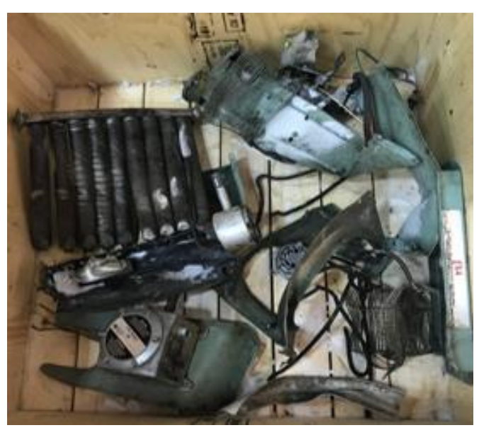
DAMAGED HEATER PARTS