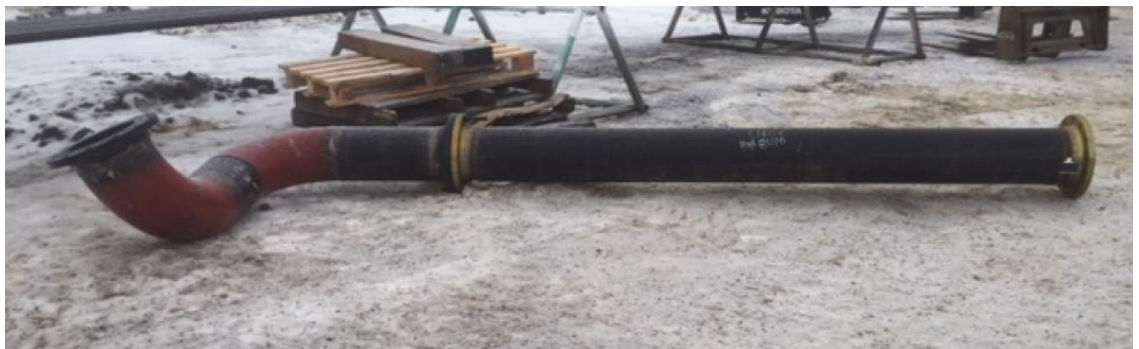
SECTION OF PIPE SPOOL WEIGHING MORE THAN 700 LBS ROLLED ONTO THE WORKER

A welder was injured when the set screw on a heavy-duty tripod pipe jack failed causing the pipe jack to collapse. The 10-inch pipe spool being worked on rolled off the V-head, forcing all the remaining pipe jacks to shift. The pipe rolled onto the welder, pushing him to the ground and crushing his upper body. The welder sustained a broken right shoulder, left arm, and broken ribs.