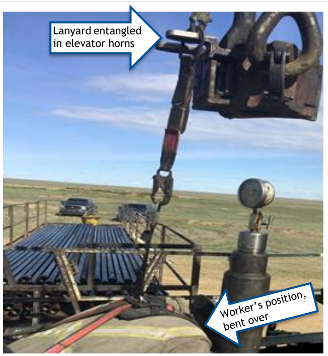
Re-enactment of equipment entanglement

Also, refer to the Line of Fire Life Saving Rule.