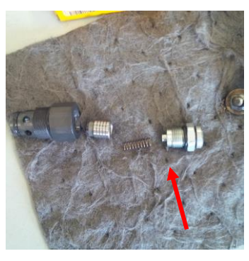
The proper order for the orifice to be assembled for use. Note location of the spring.