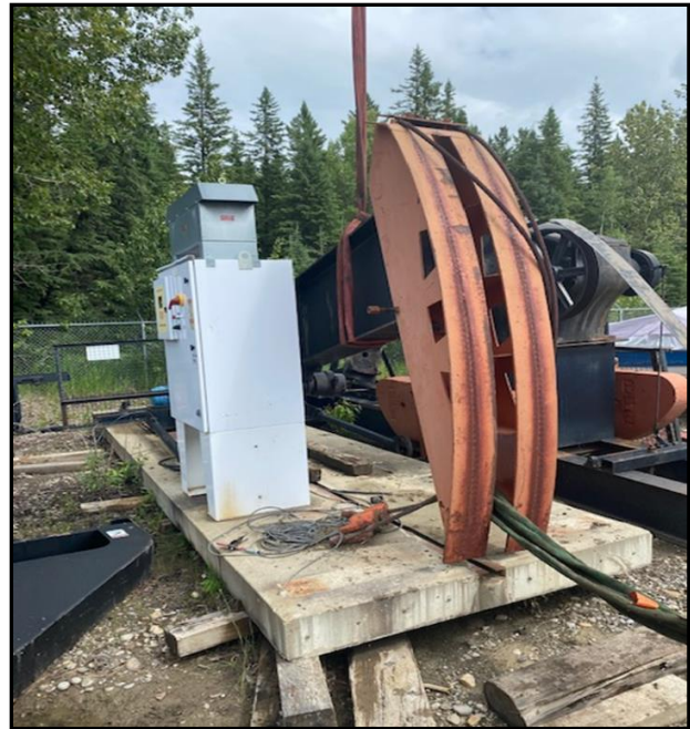
Image of the fallen equipment.