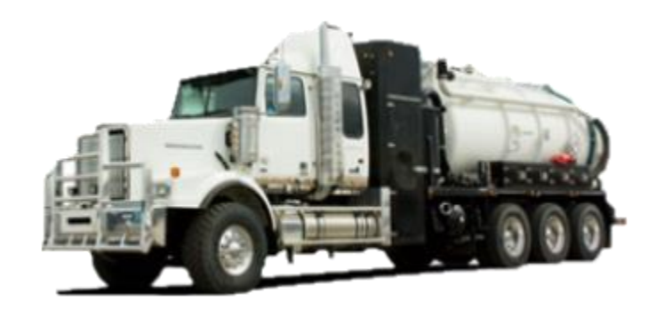
Typical combo vac unit.

The systems electrode was not functioning effectively, some of the fuel was inadequately combusted and gathered within the fire box prior to its ignition. The ignition of this excess fuel resulted in a black smoke and visible flame.