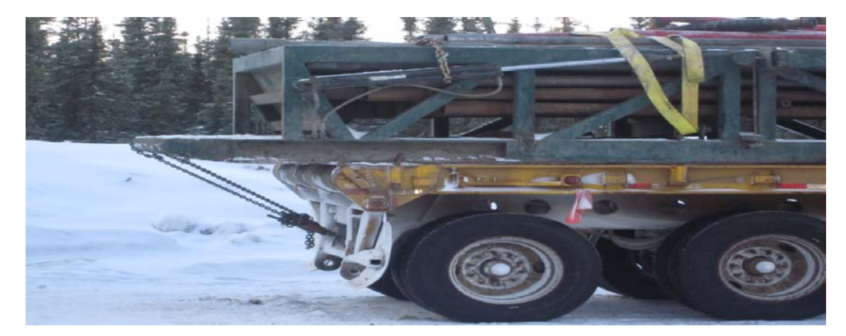
Figure 4: Pipe tub loaded on trailer