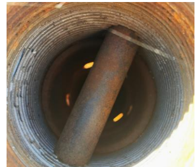
View of bar-stock collar above test stump apparatus

Help industry by sharing lessons learned from an incident. Submit your Safety Alert.