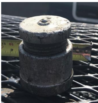
The pair of screwed-together hydraulic fitting caps that fatally struck a worker

All hydraulic fitting caps for that rig were accounted for, and it is unknown how or when they got into the test stump apparatus and BOP.