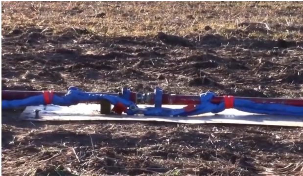
Gas piping prior to explosion

Non-compressible: Liquids like water are generally non-compressible and, as a result, when they are released they do not expand. Therefore, the energy released is only from the pressure they are under and not from the expansion that occurs after they are released.