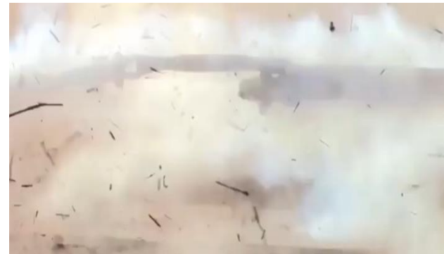
Gas piping after explosion