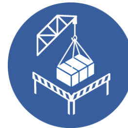
SAFE MECHANICAL LIFTING