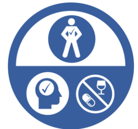
FIT FOR DUTY