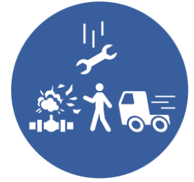
LINE OF FIRE