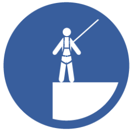
WORKING AT HEIGHT