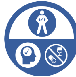
FIT FOR DUTY